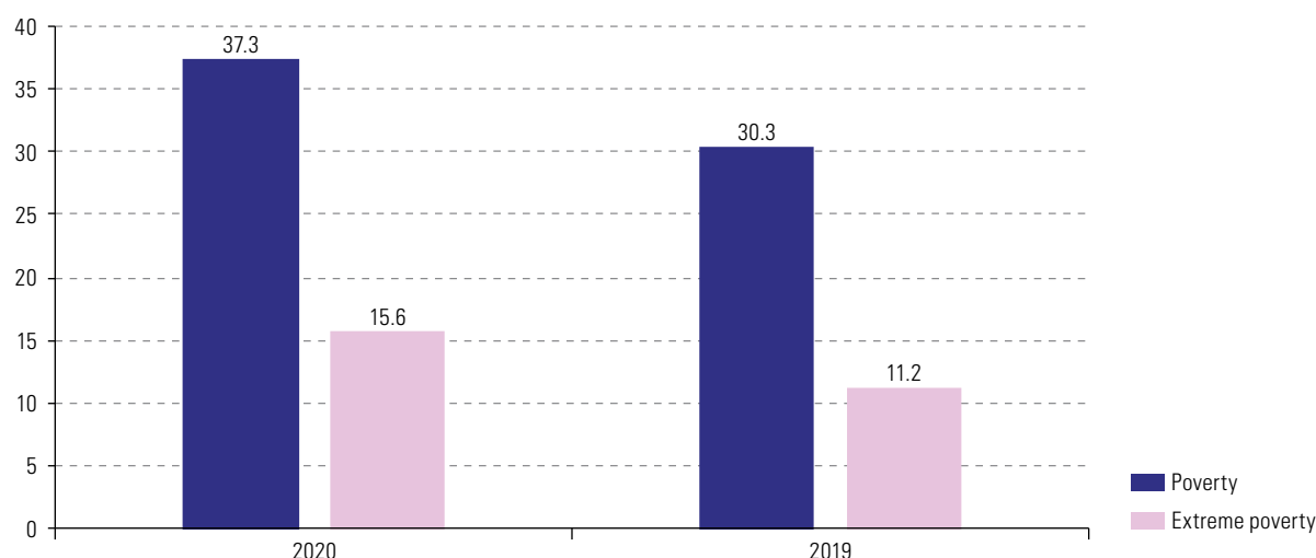
Figure 3 | Latin America (18 countries): a population living in poverty, 2019 and 2020 b (Percentages)

a The countries included are: Argentina, the Bolivarian Republic of Venezuela, Brazil, Chile, Colombia, Costa Rica, Dominican Republic, Ecuador, El Salvador, Guatemala, Honduras, Mexico, Nicaragua, Panama, Paraguay, Peru, the Plurinational State of Bolivia and Uruguay. b Figures for 2020 are projections.