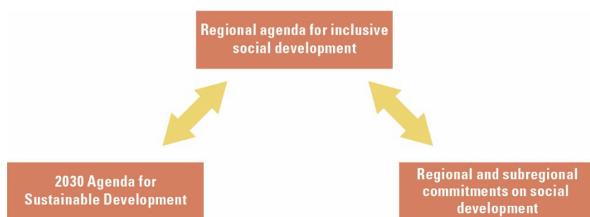
Diagram 1 Relationship between the regional agenda for inclusive social development, the 2030 Agenda for Sustainable Development and agreements on social development

The regional agenda for inclusive social development—which aims to support the implementation of the 2030 Agenda for Sustainable Development, particularly in areas related to the mandates of ministries of social development and equivalent bodies—can be conceived as an instrument founded both on the targets of the Sustainable Development Goals (SDGs) of the 2030 Agenda that are directly and indirectly related to the social dimension, and on the main populations, themes and means of implementation covered in the regional and subregional commitments on social development that have been adopted in intergovernmental fora attended by ministries of social development or equivalent bodies (see diagram 1). The regional agenda also incorporates specific themes that are relevant to inclusive development in the region but that are not covered in the above-mentioned instruments. The present document provides information on the links between them.