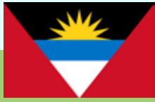
Antigua and Barbuda