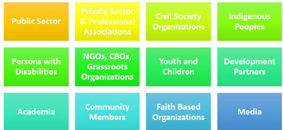
Figure 1: The range of stakeholders engaged in the VNR preparation processes

questionnaires to stakeholders. In many of the stakeholder engagements, new data sources are revealed that are useful for SDG reporting. Therefore, administering questionnaires to stakeholders provides a more efficient way of gathering information and data. The feedback from the questionnaires usually provides rich information to inform the VNR report.