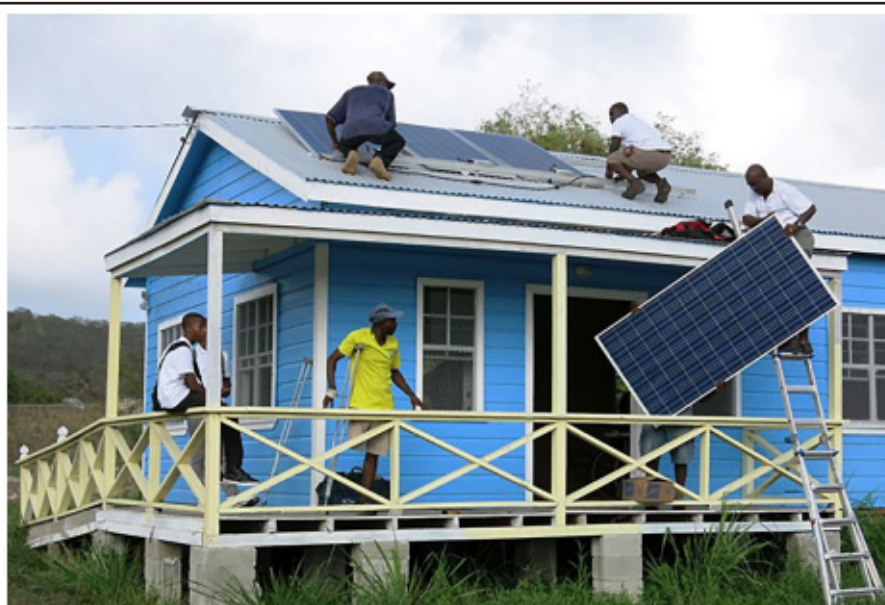
Antigua Barbuda Association for Persons with Disabilities’ community solar demonstration project.

benefit of current and future generations. Ultimately, the value of stakeholder engagement fully resonates with the subregion’s development pathways and its importance in development processes. Leveraging the benefits of consensus and shared visions towards creating development that is sustainable and equal, helps to ensure that no one is left behind on the path to a sustainable and resilience Caribbean. ■