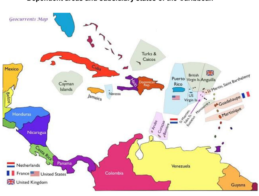
Map 1 Dependent areas and subsidiary states of the Caribbean<sup>a,b</sup>

The internationally-recognized classifications of NSGTs, SGACs and IJs that are used to define the respective governance arrangements, remain the most relevant benchmarks for assessing the political and constitutional evolution of Caribbean AMs, and are highly useful in distinguishing among the various models of dependency, autonomy and integration in the region. Figure 1 presents the Dependent Areas and Subsidiary States of the Caribbean based on the four sovereign States. Within this context, the distinctions in political status among the AMs are not unique to the dependencies of any of the sovereign States, and can be used to provide an effective classification of the AMs based on their evolving constitutional arrangements.