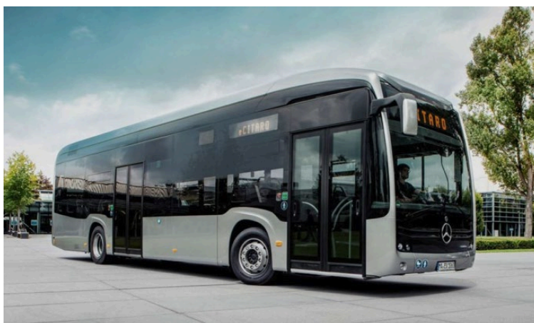
Image 1 Citaro bus model