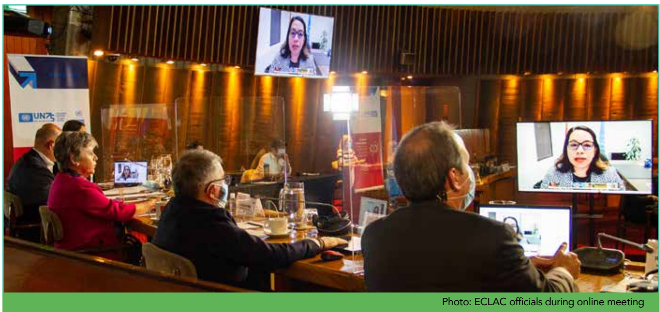
Photo: ECLAC officials during online meeting

the review of the status of institutional infrastructures and their impact on integrated decision making in the Caribbean; and support to Caribbean countries' VNRs processes. Additional areas of work include applying geospatial technologies to disaster risk management in the Caribbean, and operationalizing the member States' request at the last CDCC Session to reposition the CDCC Regional Coordinating Mechanism as the Caribbean SIDS Mechanism for Sustainable Development. This new mechanism would facilitate an integrated approach to the subregion's development efforts, including monitoring, evaluating, and reporting across multiple development agendas.