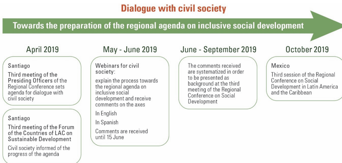
Diagram 1 Time line of the dialogue with civil society