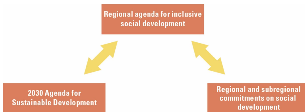
Diagram 1 Linkages between the regional agenda for inclusive social development, the 2030 Agenda for Sustainable Development and agreements on social development