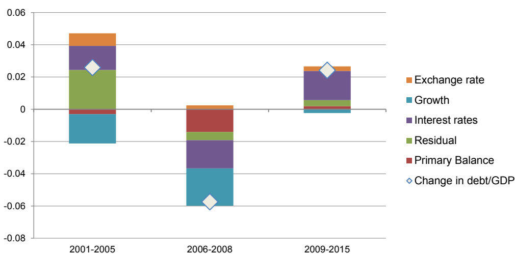
Figure 2 Caribbean average contribution to debt accumulation, 2001-2015 (Per cent of GDP)

Source: Economic Commission for Latin America and the Caribbean (ECLAC), on the basis of official data.