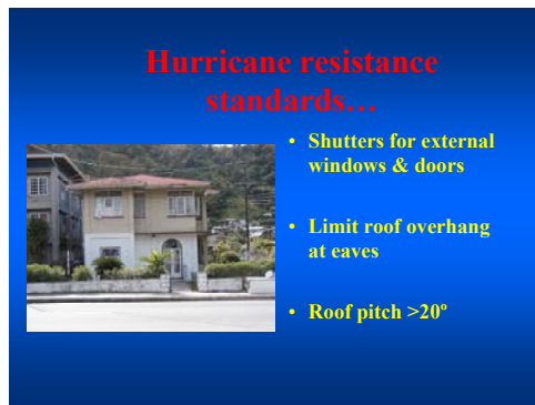
Figure 23: Hurricanes resistance standards

Building codes, when applied, reduce vulnerability to properties. Countries may choose to adopt the Caribbean Uniform Building Codes (CUBIC) or select from a number of other standards specifically tailored to their own specific needs. The application of standards across the region is being done with varying degrees of scope and success. Critical gaps in application include standards for the construction or installment of water, electricity and communications infrastructure. Mitigation planners should note with interest what seems to be a growing trend among insurance companies to use standards as the basis for costing policies for buildings they insure.