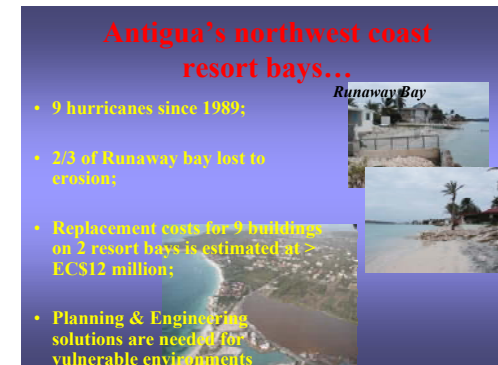
Figure 9: Indicator of Widespread damage to Antigua's North West Coast

Widespread damage by hurricanes to hotels and tourism infrastructure in Antigua, Nevis, St. Kitts and Anguilla and other countries may be partly responsible for slower growth in new hotel construction. Impact has been particularly severe for seaside properties, raising questions about the vulnerability of the beach front tourism policies in the region.