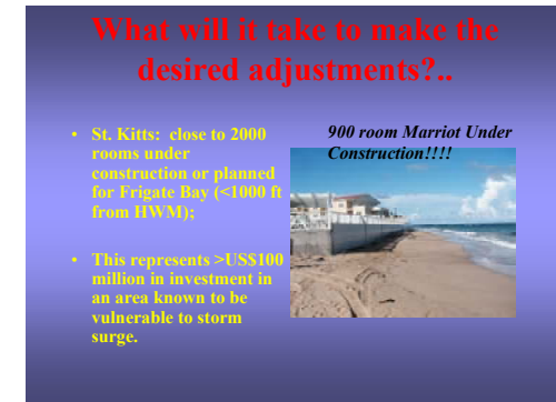
Figure 8: Indicators of tourist accommodation activity

The growth of new rooms in St. Kitts goes against the trend in tourism room construction which as Chart 3. indicates has not grown significantly in CARICOM and the Commonwealth Caribbean between 1995 and 1999.