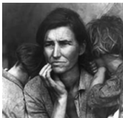
Migrant Mother, Dorothea Lange (1936)

The growth of female migration constitutes a movement that has been powerful and, until now, mostly quiet; described as "a mighty but silent river". The might of this "river" is evident in the available data, as today 94.5 million, or nearly half (49.6%) of all international migrants, are women. The most important change is that women are no