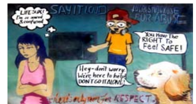
Graffiti work art from the "Say it Loud" Event, annual Week Without Violence 2003.

General Recommendation No. 19 (11th session, 1992), CEDAW