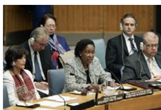
Special Adviser on Gender Issues addresses Security Council Meeting on Women, Peace and Security, 27 October 2005.