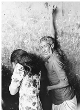
Violence against women and girls is the most pervasive violation of human rights in the world today.

The intolerable status quo: Violence against women and girls, by Charlotte Bunch.