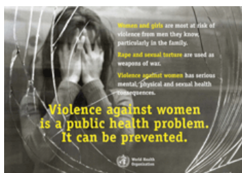
Poster to fight violence against Women, WHO.