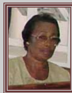
2001- Deputy Governor General 2002 Acting Governor General

A former nurse and magistrate from 1995. (b. 1944).