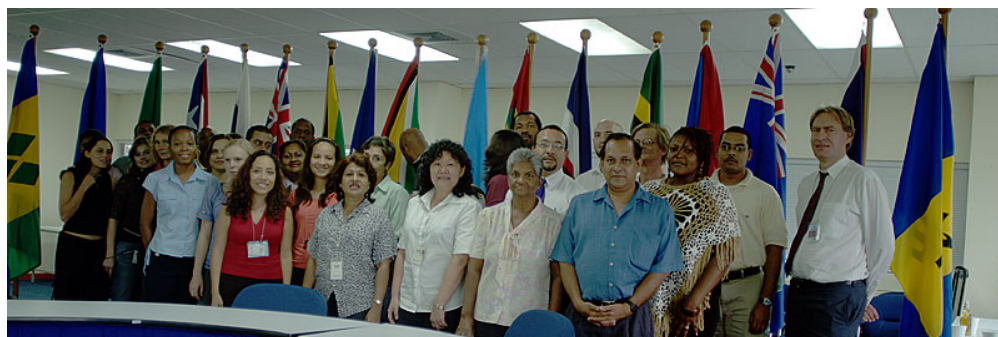
Group Picture, ECLAC Staff Members, September 2005

The Statistics and Social Development Unit of the ECLAC Subregional Headquarters for the Caribbean has as its focus the conduct of research and analysis on the areas of women and development; population and development, (migration and teenage fertility), poverty, and other social development issues such as the conditions of vulnerable groups in the society, social reform and social policy formulation. In this regard, the ECLAC/CDCC secretariat is responsible for assisting member States with the implementation of programmes of action coming out of international conferences such as the World Summit for Social Development (WSSD); the International Conference on Population and Development (ICPD), and the Fourth World Conference on Women (Beijing Conference).