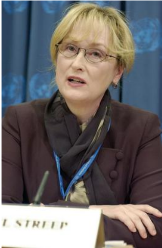
Meryl Streep, actress and member of a women's rights group, Equality Now, addresses correspondents at a press conference on the campaign against discriminatory laws, in conjunction with the ongoing 49th Session of the Commission on the Status of Women, 2 March 2005