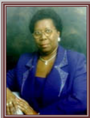
1997- Governor General Hon. Dr. Dame C. Pearllette Louisy Saint Lucia

Head of a number of national and international nurse organizations, North American President of the World Council of Churches 1983-1991, President of the World YWCA 1975-1983 and worked with the WHO before becoming Ambassador to the United Nations, Cuba and the Dominican Republic 1986-1990, candidate for the post of United Nations General Assembly President in 1988. She was the sister of Errol W. Barrow (1920-87), Prime Minister (1966-1976 and 1986-1987).