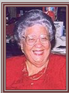
1999- Deputy Dame Yvonne Maginley Antigua and Barbuda

Deputy Permanent Secretary in the Ministry of Works and Utilities 1975-1978, worked in the private sector, Secretary General of The National Movement Party, Senator and Minister in the government 1990-2001. In November she was named acting Governor General, and confirmed by the Queen, 01.01.02. She had been appointed to serve as Deputy to the Governor General on two earlier occasions. (b. 1930)