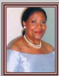
2007- Governor-General Louise Lake-Tack Antigua and Barbuda

Appointed Governor-General's Deputy and Ambassador-at-Large. She is Former Director General of the Tourism Board in the Ministry of Tourism. In 2003 she was Created Dame Commander of the British Empire.