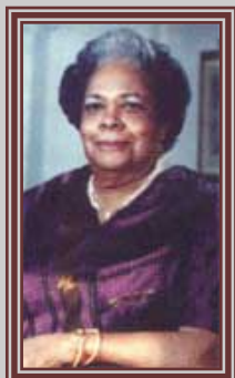
1990-1995 (†) Governor General Hon. Dame Nita Barrow Barbados

Head of a number of national and international nurse organizations, North American President of the World Council of Churches 1983-1991, President of the World YWCA 1975-1983 and worked with the WHO before becoming Ambassador to the United Nations, Cuba and the Dominican Republic 1986-1990, candidate for the post of United Nations General Assembly President in 1988. She was the sister of Errol W. Barrow (1920-87), Prime Minister (1966-1976 and 1986-1987).