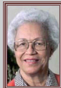
2001-05 Governor General Dame Dr. Ivy Leona Dumont The Commonwealth of the Bahamas

Teacher, administrator, Vice-Principal and then Principal of St. Lucia's College. (b. 1946)