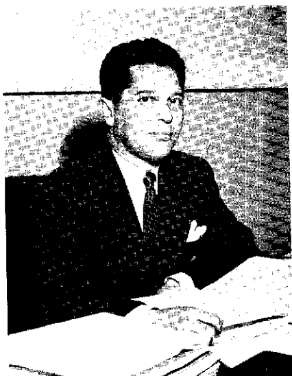
José Antonio Mayobre (Venezuela), 1963-1966