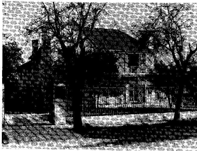
First ECLAC headquarters building in Santiago, Chile, Pío X street.