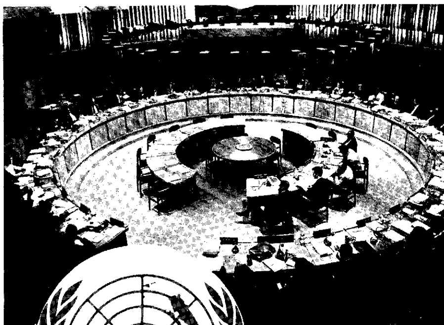
"Raúl Prebisch" Conference Room, United Nations Building, Santiago.