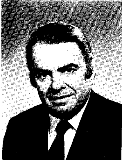
Enrique V. Iglesias (Uruguay), 1972-1985