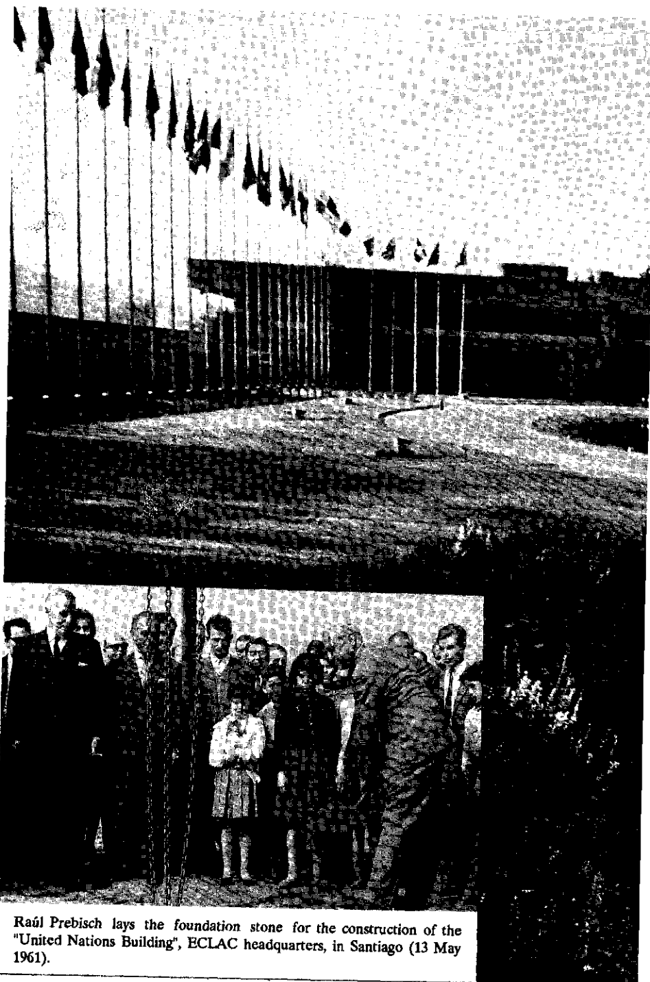
Raúl Prebisch lays the foundation stone for the construction of the "United Nations Building", ECLAC headquarters, in Santiago (13 May 1961).