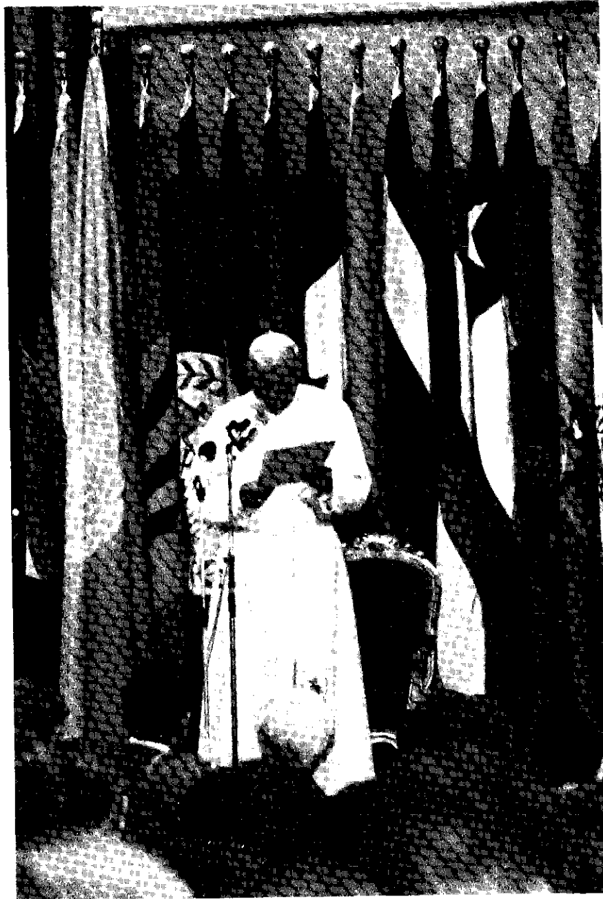
Pope John Paul II prays for an "economy of solidarity" in his message to the peoples of Latin America and the Caribbean during his visit to ECLAC on 3 April 1987.