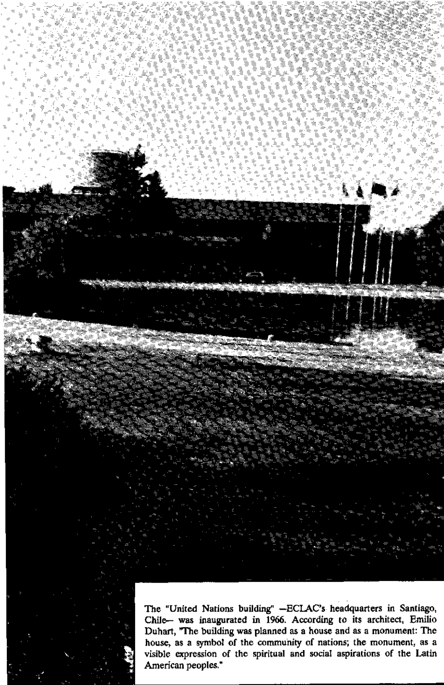
The "United Nations building" —ECLAC's headquarters in Santiago, Chile— was inaugurated in 1966. According to its architect, Emilio Duhart, "The building was planned as a house and as a monument: The house, as a symbol of the community of nations; the monument, as a visible expression of the spiritual and social aspirations of the Latin American peoples."