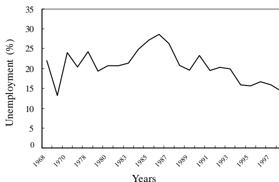
FIGURE 2 Dominican Republic: Unemployment, 1968-1998