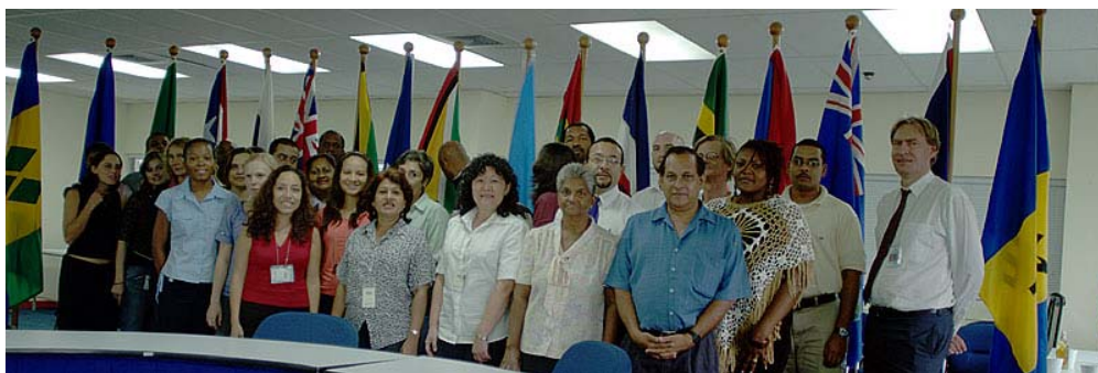
Group Picture, ECLAC Staff Members, September 2005

The Statistics and Social Development Unit of the ECLAC Subregional Headquarters for the Caribbean has as its focus the conduct of research and analysis on the areas of women and development; population and development, (migration and teenage fertility), poverty, and other social development issues such as the conditions of vulnerable groups in the society, social reform and social policy formulation. In this regard, the ECLAC/CDCC Secretariat is responsible for assisting member States with the implementation of programmes of action coming out of international conferences such as the World Summit for Social Development (WSSD); the International Conference on Population and Development (ICPD), and the Fourth World Conference on Women (Beijing Conference).