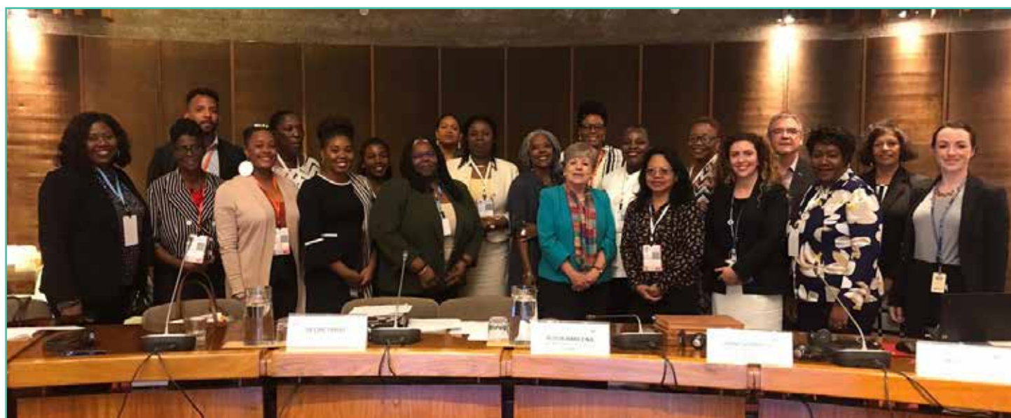
Caribbean attendants of the XIV regional Conference on Women and the ECLAC Executive Secretary, Alicia Bárcena.

During the closing session of the XIV Conference, ECLAC’s Executive