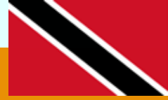
Trinidad and Tobago

The Department of Health and Wellness of Saint Lucia has made efforts to restrict the likelihood of the introduction of COVID-19, popularly known as the novel coronavirus, into the Saint Lucian population. As such the Saint Lucian authorities have placed restrictions on non-nationals who have a travel history from Mainland China within the last 14 days.