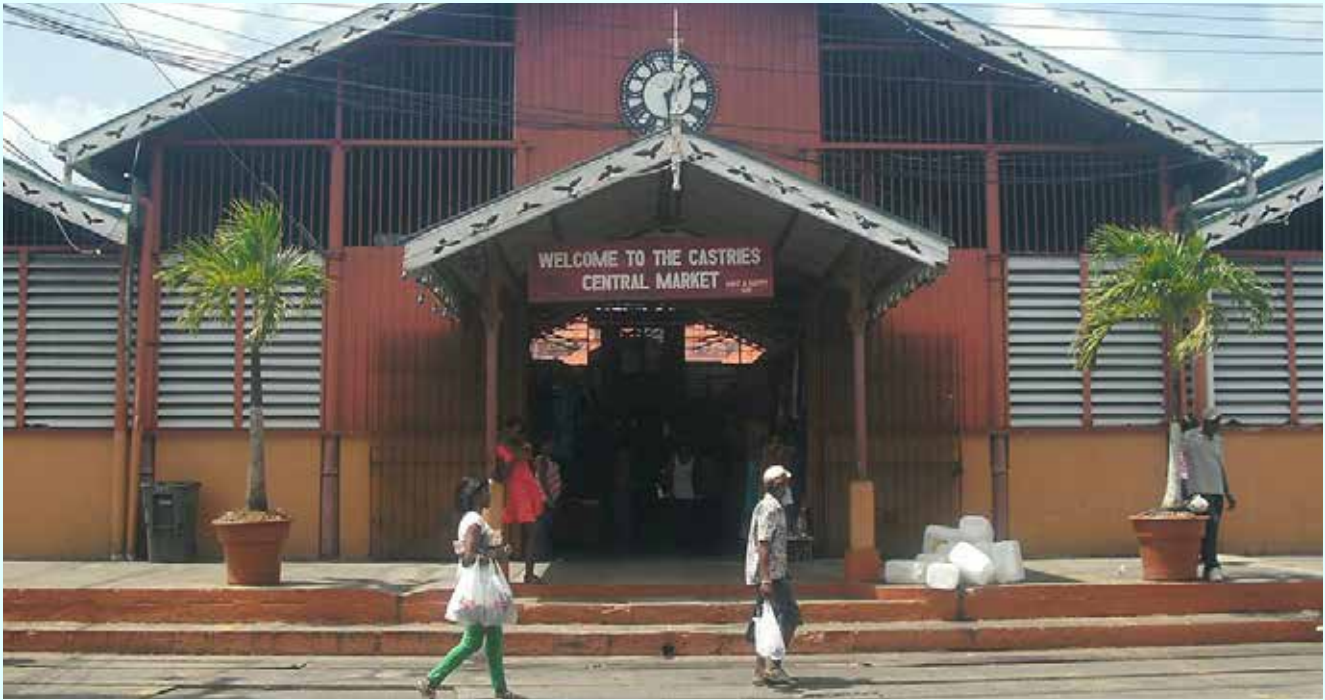
Photo of Castries Market