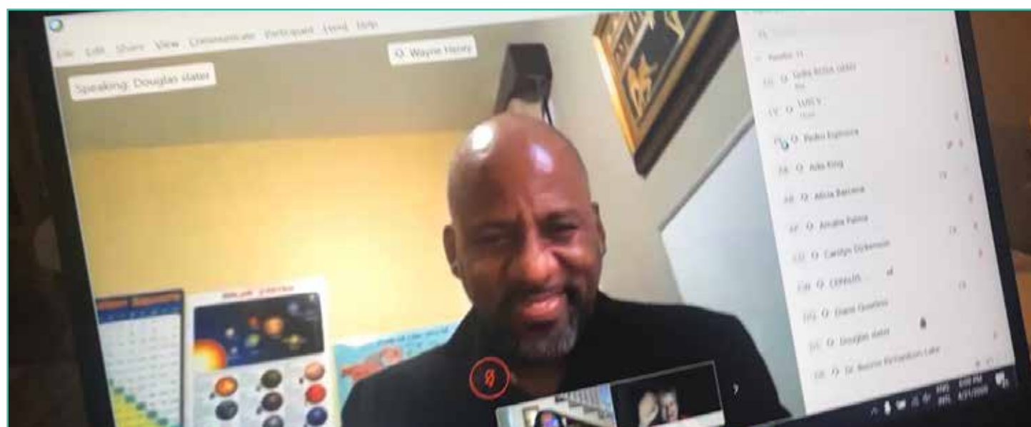
Photo of attendant at virtual meeting