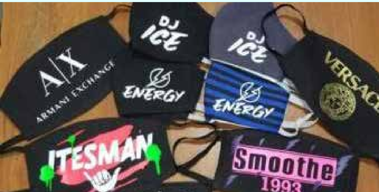
Photo of Swag Style masks courtesy: https://dpi.gov.gy/fashion-with-a-purpose/