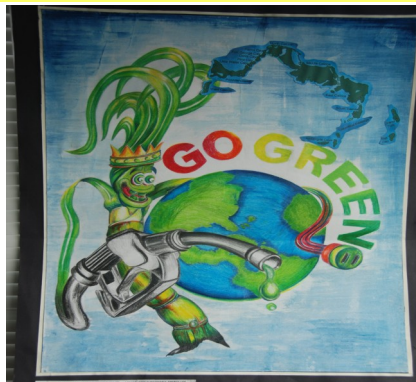
The poster created by Watson Morency of Turks and Caicos Islands, the senior category winner.

Choosing winners was no easy task, according to some of the judges, who were suitably impressed by the quality of the entries.