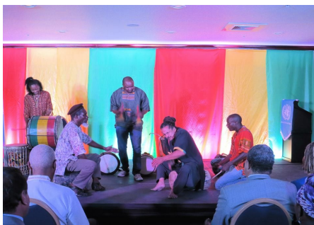
The Akwaba Drummers entertained the audience, along with other cultural performers.

These included Guyana's Minister of Foreign Affairs, Carolyn Rodrigues-Birkett, her Saint Vincent and the Grenadines counterpart, the honourable Camillo Gonsalves, and the Foreign Minister of Saint Lucia, the Honourable Alva Baptiste.