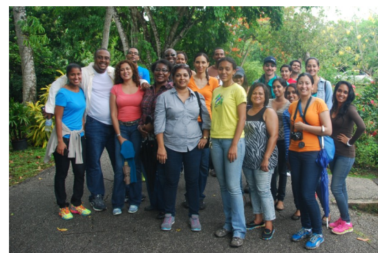
A happy group at the end.