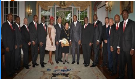
The new cabinet.

THE new Antigua and Barbuda cabinet of Prime Minister Gaston Browne was sworn in on 16 June 2014. The ministers took their oaths at Government House before making their way to the Antigua Recreation