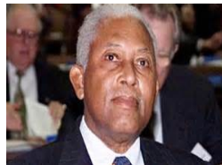
The late Arthur NR Robinson of Trinidad and Tobago.

The Secretary-General recalled Mr Robinson's contribution to the landmark Conference of the Heads of Government at Grand Anse, Grenada in 1989 at which he presented a paper "The West Indies Beyond 1992" which among other