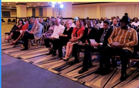
At centre: ECLAC Executive Secretary Alicia Barcena sits with some of the Ministers who attended the IYS event in Jamaica.

THE International Year of Small Island Developing States (IYS) gala held at the Pegasus Hotel in Kingston, Jamaica in April 2014, was indeed a celebration of Caribbean culture.