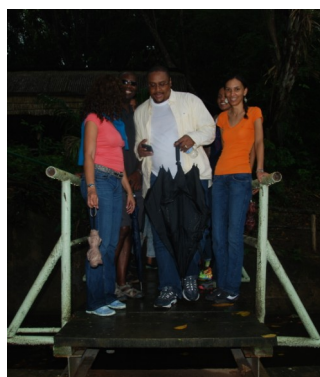
Ready for the rain!