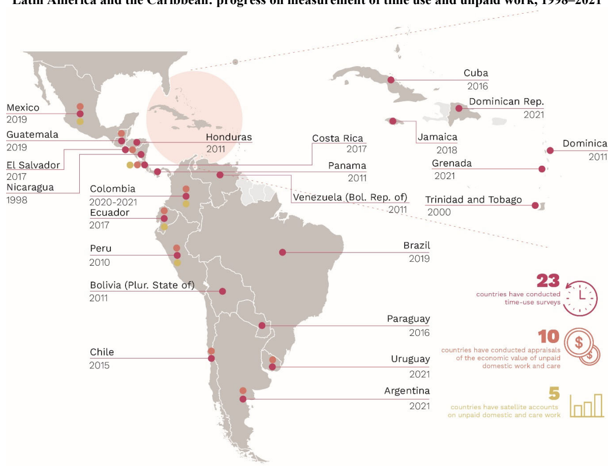
Map V.1 Latin America and the Caribbean: progress on measurement of time use and unpaid work, 1998–2021

The section will also examine progress on time-use survey processes since adoption of the Montevideo Strategy in 2016. To date, 23 countries in Latin America and the Caribbean have conducted at least one measurement of the time spent on domestic and care work, 10 have measured the economic value of unpaid work in households and 5 have calculated a satellite account for unpaid work in households (see map V.1).