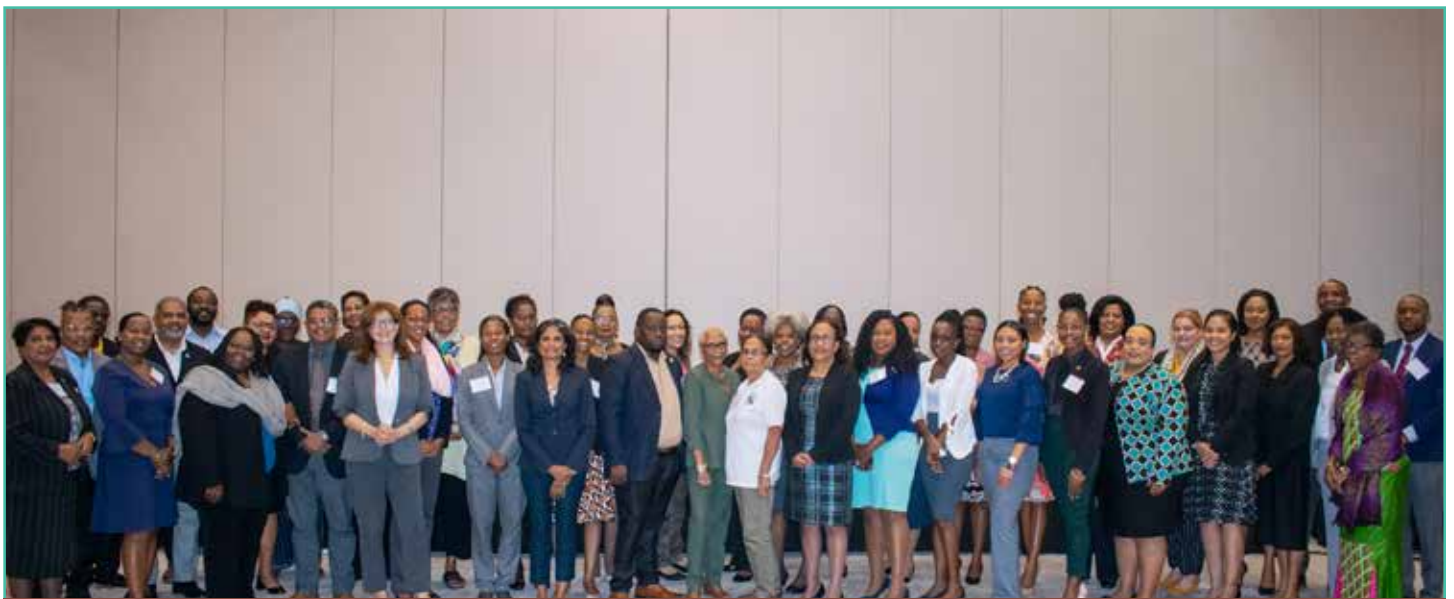
Attendants of the Symposium on Mainstreaming Gender in Water Resources Management, Climate Change and Disaster Risk Reduction Policies in the Caribbean