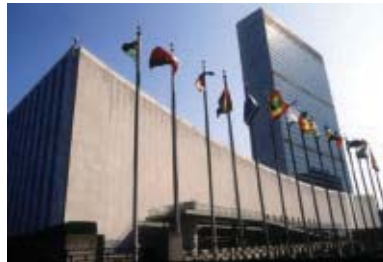
April 2002 - Madrid Spain

With the adoption of the Madrid Plan of Action (MIPAA) at the Second World Assembly on Ageing held in Madrid in 2002, population ageing and its implications on societies have finally moved to the forefront of many