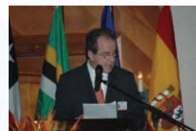
Mr. Jose Luis Machinea, ECLAC Executive Secretary

Seven CDCC member states were elected to serve on the Committee of the Presiding Officers of the Regional Conference, namely Cuba, Dominican Republic, Haiti, Jamaica, Puerto Rico, Suriname and the Turks and Caicos Islands.