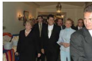
L -R: Ms. Michelle Bachelet, President of Chile, Mr. Rafael Correa, President of the Republic of Ecuador, Ms. Maria Teresa Fernandez de la Vega, First Vice-president of Spain

The Caribbean Subregion was represented by eleven CDCC member states, namely Antigua and Barbuda, Belize, Cuba, Dominican Republic, Grenada, Jamaica, Haiti, Puerto Rico, St. Lucia, St. Kitts and Nevis, St. Vincent and the Grenadines, one Associate member state, the Turks and Caicos Islands and two observer states, the Cayman Islands and St. Maarten. The National Union of Domestic Employees of Trinidad and Tobago was the lone NGO representative.