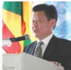
Mr. Sha Zukang UN Under-Secretary- General for Economic and Social Affairs,

had agreed to the establishment of a Regional Coordinating Mechanism for the implementation of MSI+5. The Grenada MSI+5 Meeting was the final of a series of three regional meetings held in preparation for the United Nations General Assembly at its sixty-fifth session in September 2010.