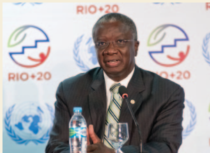
Freundel Stuart, Prime Minister of Barbados, briefs the press on the Secretary-General's "Sustainable Energy for All" initiative on the Conference sidelines.