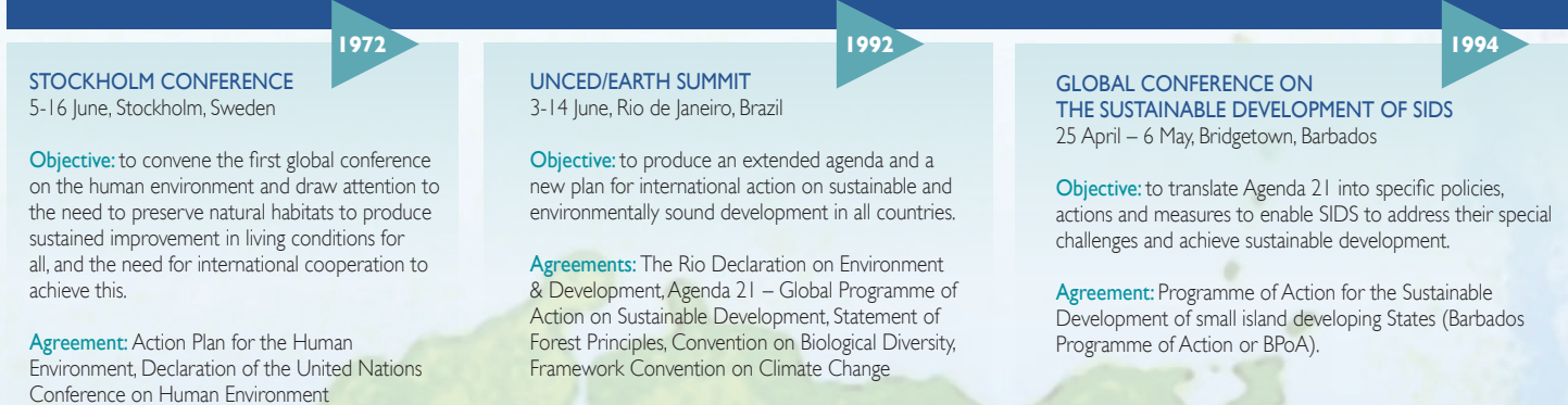
FIGURE I. KEY SUSTAINABLE DEVELOPMENT CONFERENCES LEADING UP TO RIO+20

Sustainable Development (WSSD) then set out further commitments in poverty eradication, health, trade, education, science and technology, regional concerns, natural resources and institutional arrangements. A 10-year review of the implementation of the BPoA was then conducted in 2005, and this resulted in the Mauritius Strategy for the Further Implementation of the BPoA. The Mauritius Strategy sets forth actions and strategies in 19 priority areas and, together with the BPoA, they represent blueprints for SIDS in line with the implementation of Agenda 21. These include development clusters in five areas: natural resources and environmental threats, economic issues, social issues, governance and issues relating to implementation (UNDP Pacific Centre, 2008).