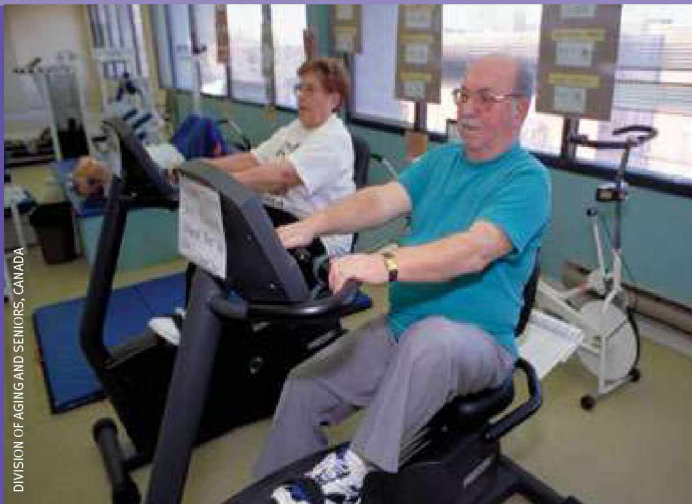
DIVISION OF AGING AND SENIORS, CANADA