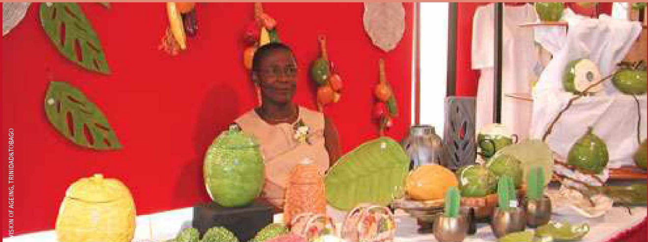
VISION OF AGEING, TRINIDAD AND TOBAGO