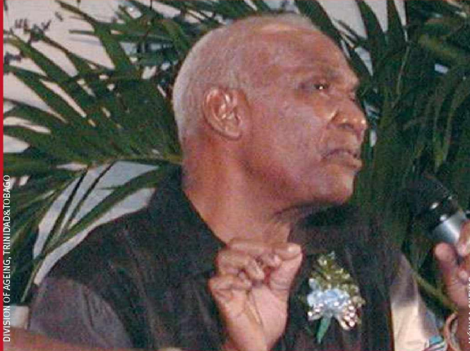
DIVISION OF AGEING, TRINIDAD & TOBAGO