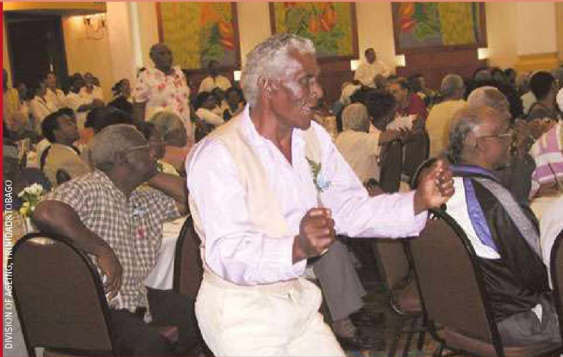
DIVISION OF AGEING, TRINIDAD AND TOBAGO

Implementation of the Regional Strategy: