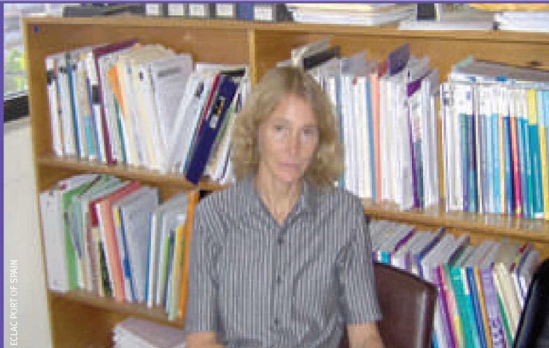
ECLAC PORT OF SPAIN